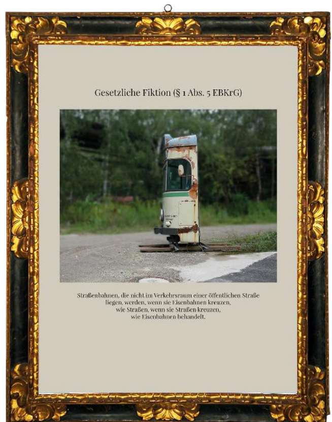
Figure 4: "Trams are treated if they cross railways as if they were roads, and if they cross roads as if they were railways." Railway Crossing Act, § 1 Section 5 (Eisenbahnkreuzungsgesetz/EBKrG)